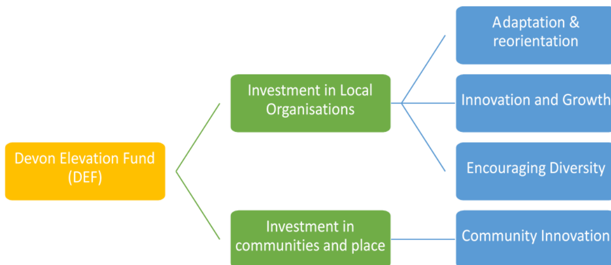
Fig 1 – Funding Priority Themes

The UK Community Renewal Fund is a UK Government programme for 2021/22. This aims to support people and communities most in need across the UK to pilot programmes and new approaches to prepare for the UK Shared Prosperity Fund. It invests in skills, community and place, local business, and supporting people into employment. For more information, click here