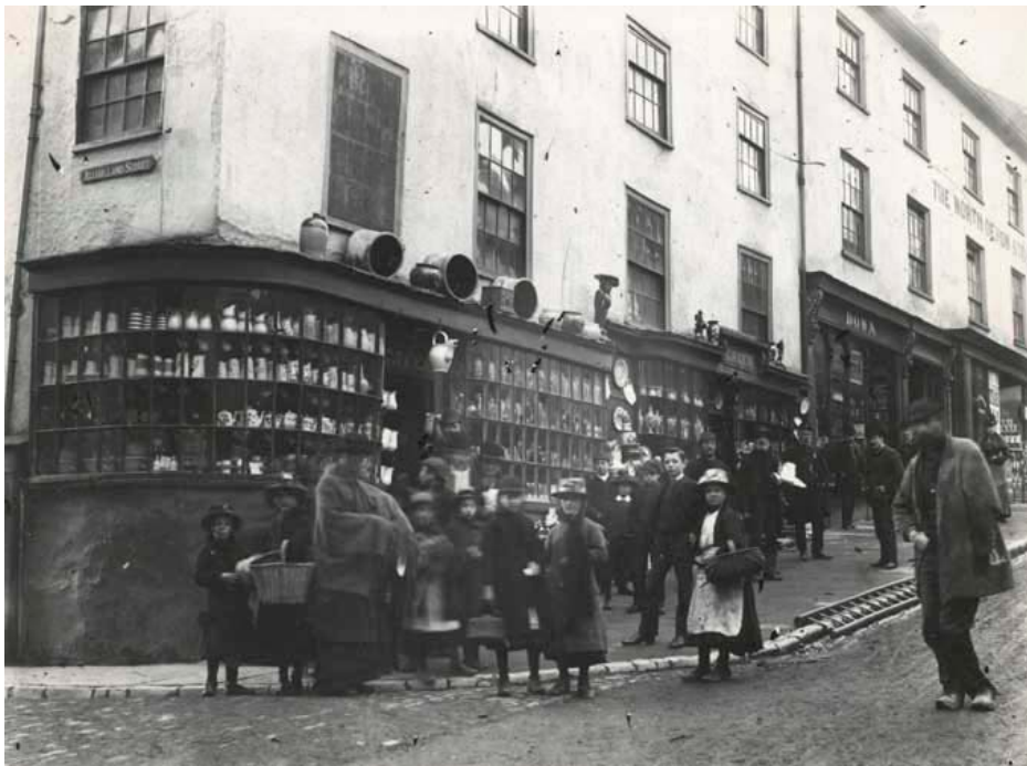
Greens Pot Shop Bideford 1887? P&D48265

Staff have been busy scanning and cataloguing a collection of photographs belonging to Bideford Library. By the time you read this the originals should be back at Bideford but you can still see them by logging on to the Local Studies website at www.ldevon.gov.uk/localstudies .