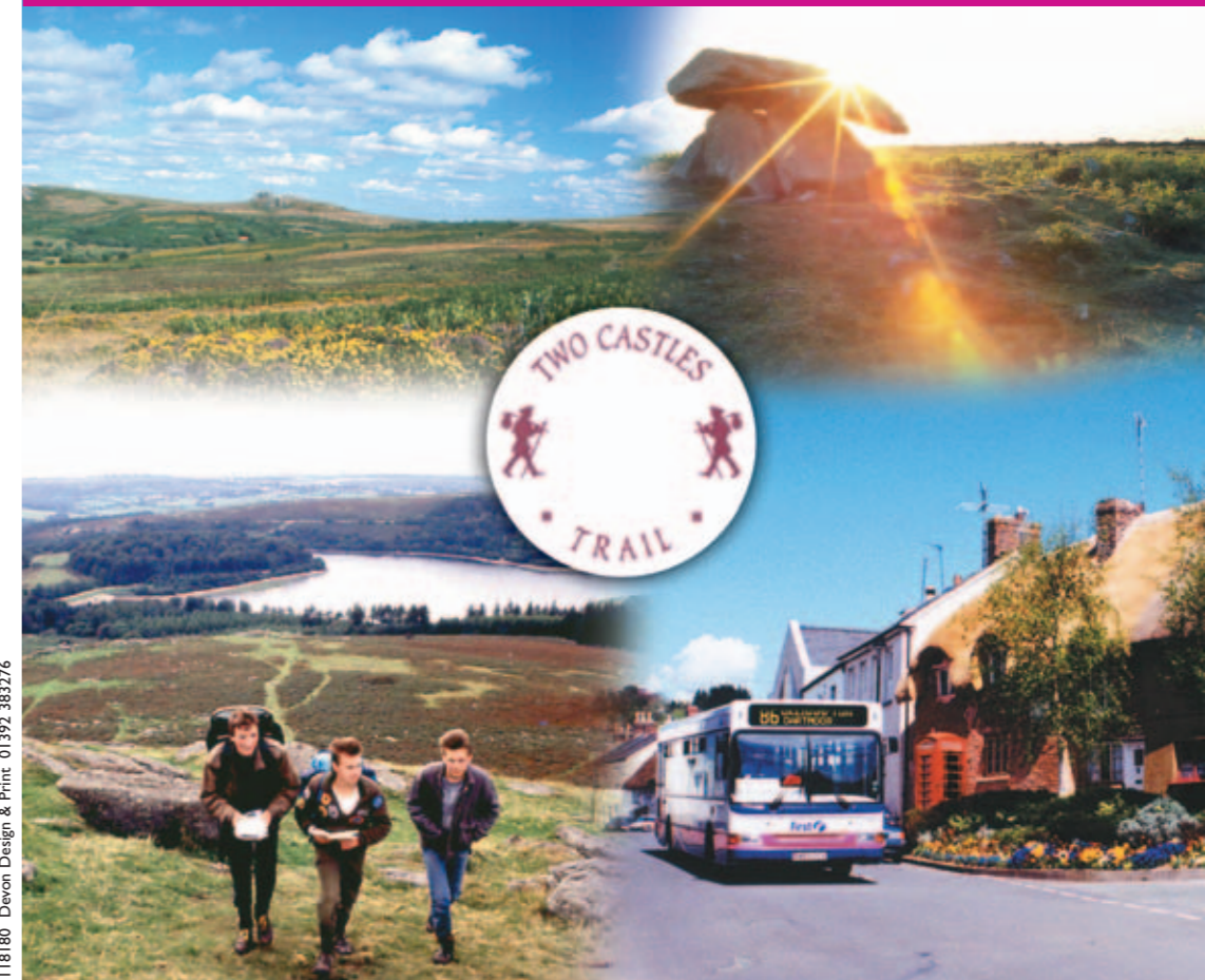
118180 Devon Design & Print: 01392 383276

A walk through Devon's past - an Iron Age hill fort, ancient standing stones, Saxon battle ground, Norman church and castle, Jacobean house and Victorian manor.