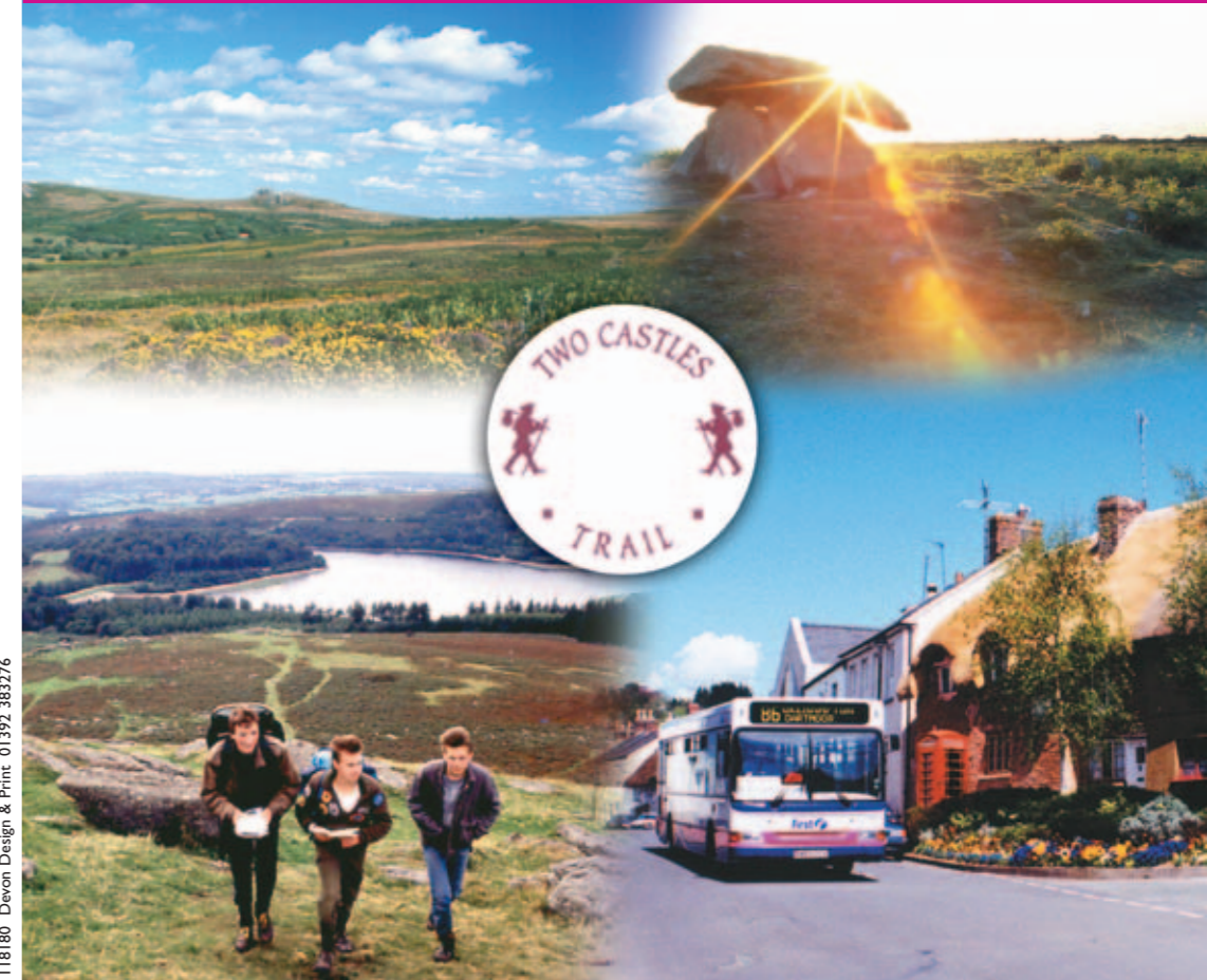
118180 Devon Design & Print: 01392 383276

A walk through Devon's past - an Iron Age hill fort, ancient standing stones, Saxon battle ground, Norman church and castle, Jacobean house and Victorian manor.