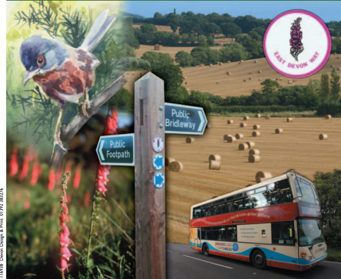
116938 Devon Design & Print: 01392 383276

A half-day walk in a beautiful part of the East Devon countryside, starting from Newton Poppleford. Take a short bus ride and walk back - creating a great walking circuit.