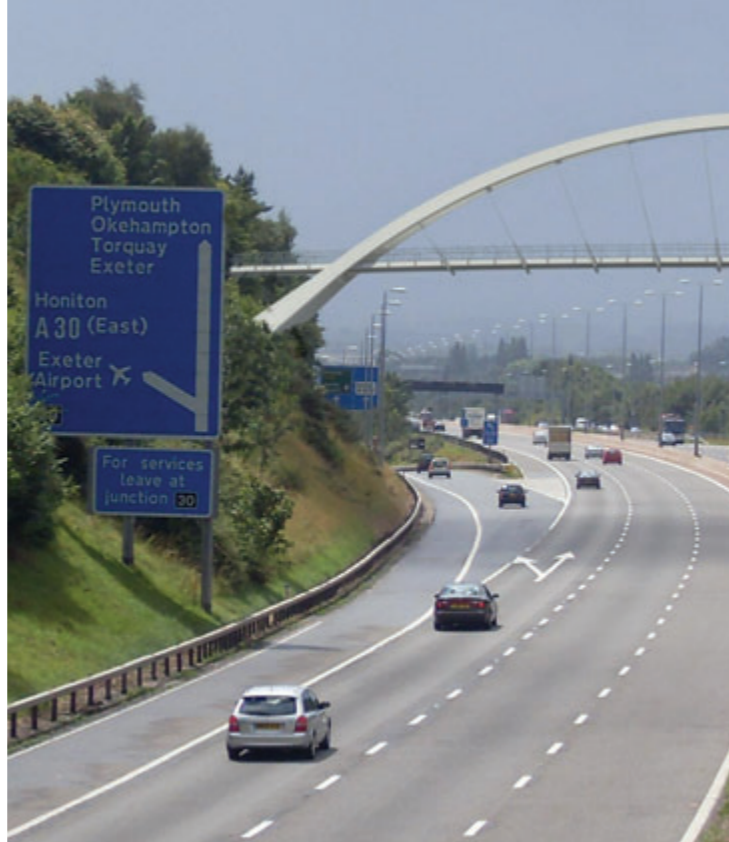
Pedestrian and cycle bridge over the M5 to be completed in 2011

These improvements do provide some additional capacity for vehicles, however with the level of growth planned it will still be essential for people to use sustainable transport to a much greater extent.