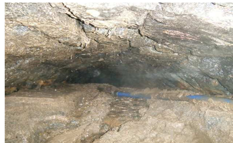
A siphon culvert 80% filled with silt, prior to cleaning

When the canal was built it crossed the line of many streams and ditches. As the canal engineers wanted to control the flow of water into the canal as much as possible, most of these watercourses were directed underneath the canal through culverts. Many of these are U-shaped siphon culverts and tend to fill up with silt and debris over time. This silt makes them work less effectively and makes inspection of the structures