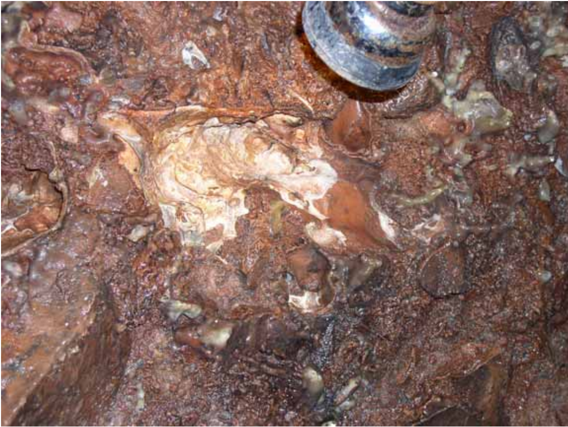
istocene cave bear skull in-situ in the roof of Kents Cavern (torch for scale)