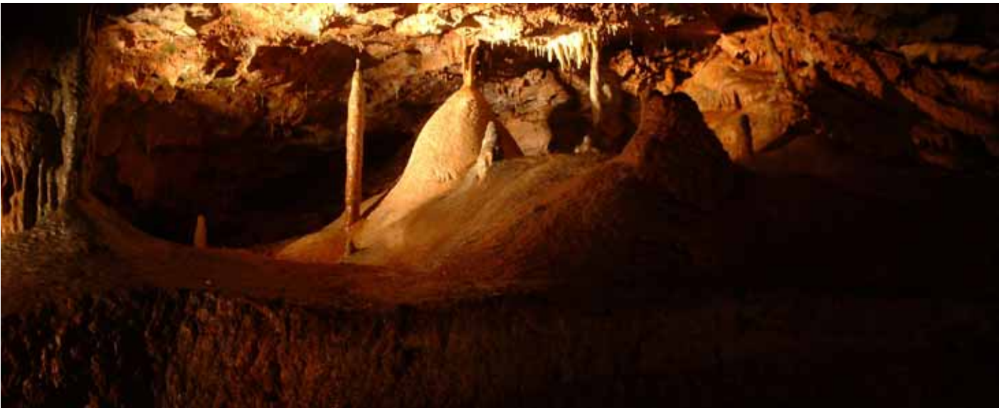
Panoramic views of cave formations in Kents Cavern