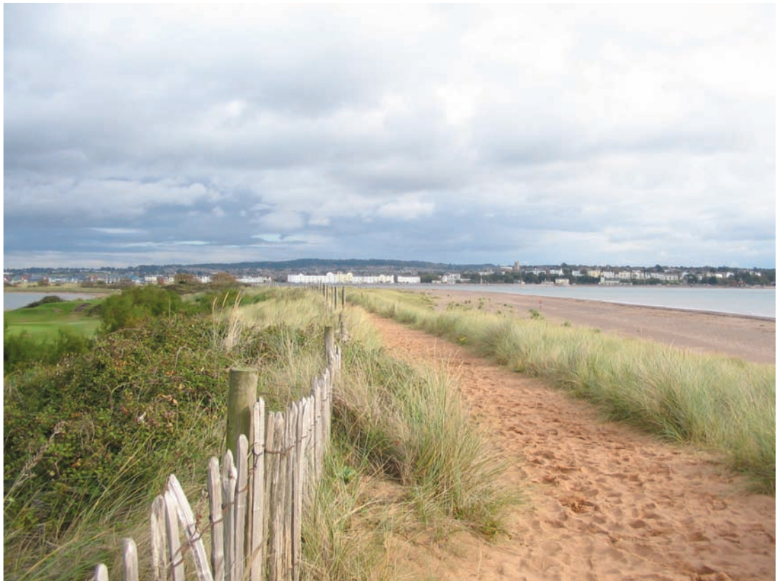
General views of Dawlish Warren showing the sand spit structure.