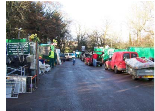
Woods Farm Recycling Centre annual throughput 2000 - 2011