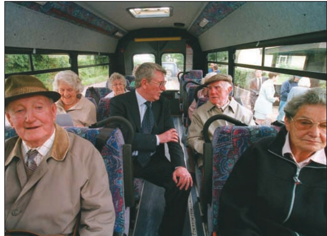
The success of Devon’s new Flexibus was seen by Lord Macdonald, the Transport Minister, on his visit to Devon in July 2000