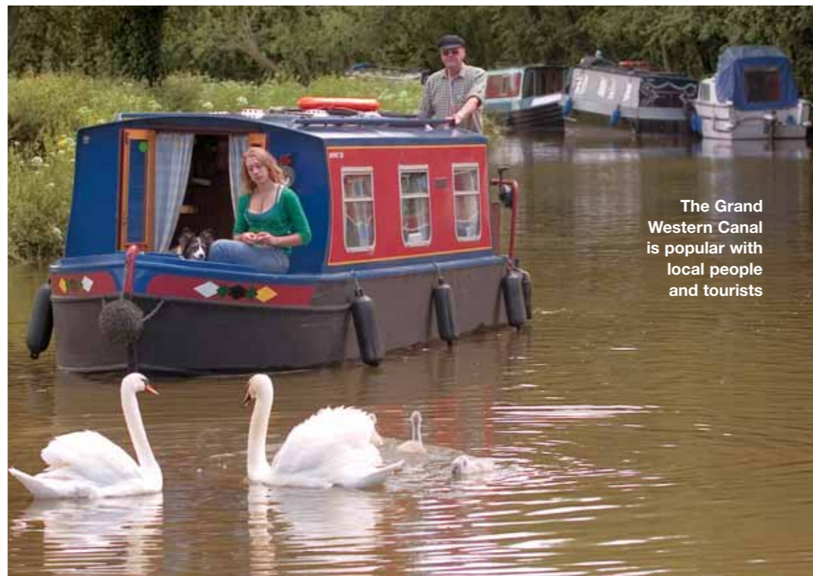
The Grand Western Canal is popular with local people and tourists

"I hope this helps the regeneration of Cullompton, and that people will come to use and admire this building for many generations to come."