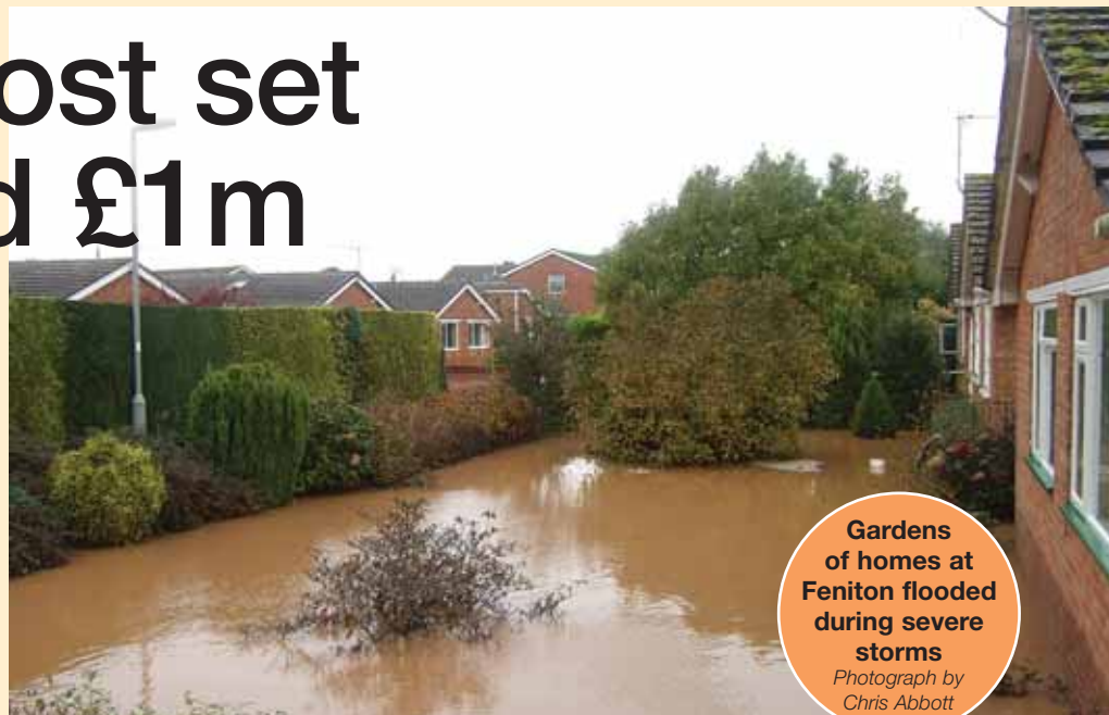
Gardens of homes at Feniton flooded during severe storms

residential areas of Feniton and Ottery St Mary had to be cleared. There is ongoing work to clear the remainder of the network of debris before the damage and any blockages of the drainage system can be fully assessed and dealt with – which could take several months.