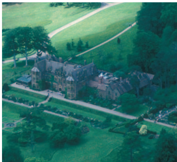
Knightshayes Court, the 19th century seat of the Heathcoat-Amory family at Tiverton.

The Devon Historic Environment Service also works with a wide range of academic institutions, local amenity groups and individual amateur archaeologists and local historians who make significant contributions to the study and recording of Devon's historic environment.