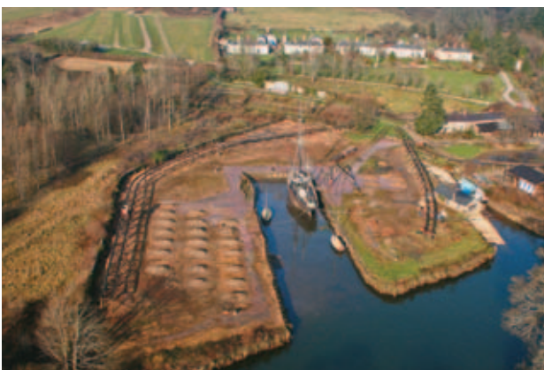
Morwellham Quay, once the greatest copper ore port in the world and now part of the Cornwall and west Devon Mining Landscape World Heritage Site.

Devon County Council recognises that much of the work of protecting the historic environment depends on the understanding and goodwill of