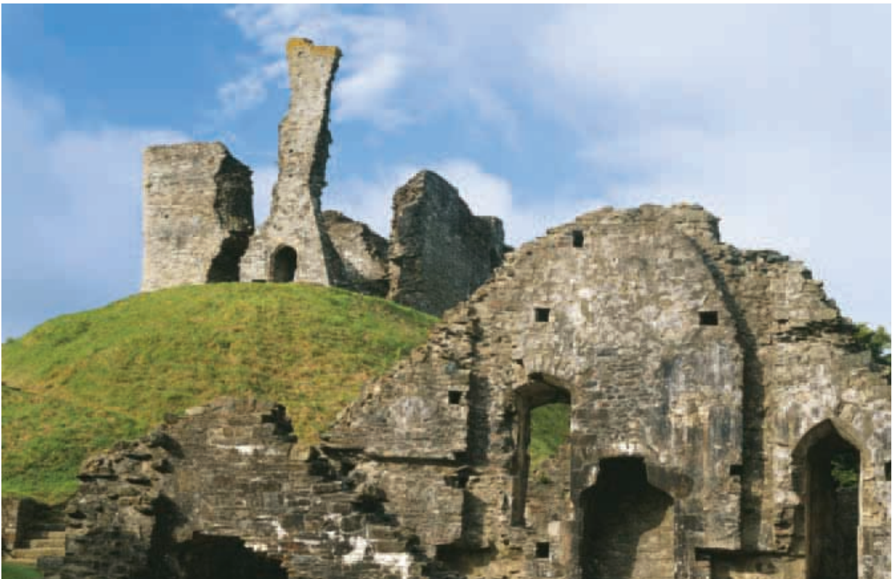
Okehampton Castle. The Norman motte and ruins of the keep and bailey.

Devon County Council owns 4,600 hectares of agricultural land with farmhouses and farm buildings, as well as seventy-three Listed buildings, three hundred and eighty Listed bridges and three Scheduled Monuments. A start has been made on auditing and identifying the historic elements of the farm estate but this work needs to be extended and acted upon to ensure their proper consideration. There are growing pressures on other Devon County Council owned Listed buildings, especially schools.