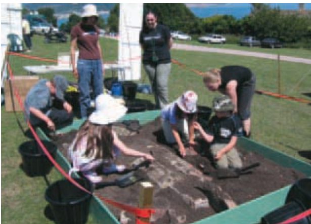
Fun for all the family. The Archaeology Fair at Beer Head, part of National Archaeology Week 2006.

Giving the best possible start in life to Devon's children and young people: With some of the most scenic and highly designated countryside in the country and the local character and heritage of its towns and villages, Devon offers children and young people a unique range of environmental learning opportunities. Devon's historic environment is a resource that provides an ideal vehicle to enrich the wider learning experience by giving young people a real and