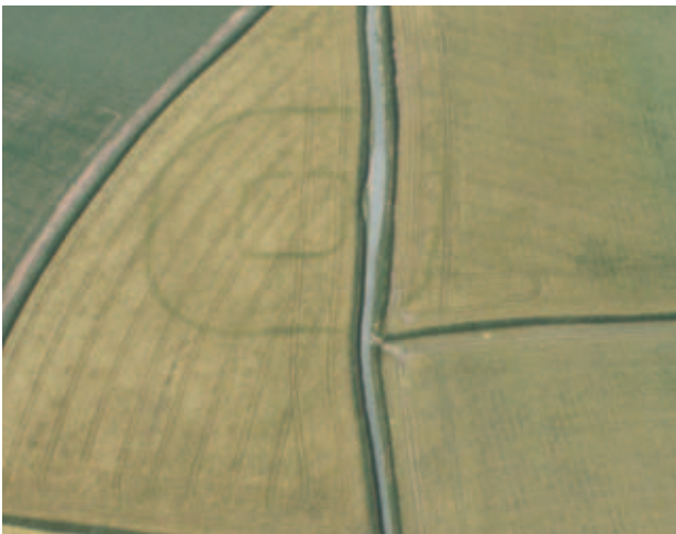
Roman fortlet at Ide, south-west of Exeter.