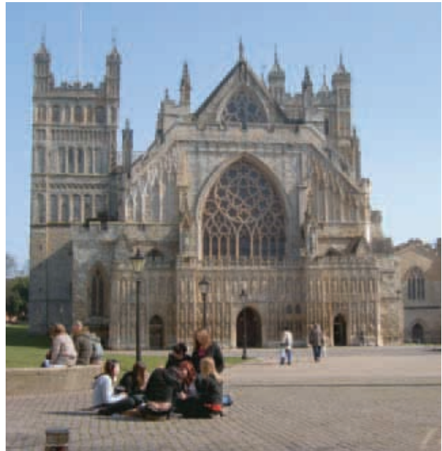
The west face of Exeter Cathedral (DCC).

Transport: Devon has a number of Roman roads, most notably the road from Dorchester to Exeter and at Axminster its junction with the Fosse Way from Lincoln. Devon's present huge network of roads and lanes evolved in the Middle Ages and is largely unstudied. Road improvement through turnpiking commenced after 1750 and influenced the modern main road system we have today, besides leaving evidence in the form of tollhouses and milestones. Devon has a very high number of historically significant road bridges including two major medieval bridges at Barnstaple and Bideford. Devon never had an extensive canal system, although the Exeter Canal is the oldest in the country. The Stover Canal, the Grand Western Canal and the Bude Canal survive in various states of preservation. At its peak c.1900, Devon's railway network was very extensive, but most of the branch lines have now been closed. The remains of Brunel's Atmospheric Railway in South Devon are historically important and interesting railway buildings and features survive on both open and disused lines. As a maritime county, coastal and seaborne trade and transport has historically been a significant component of Devon's economy. Ports such as Exeter (with Topsham), Dartmouth and Barnstaple ranked amongst the wealthiest in England in the 17th century. This has left a legacy of fine architecture, ancillary industries