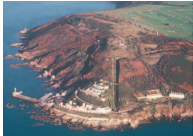
Fort Bovisand and Staddon Heights, 19th century and earlier fortifications protecting Plymouth Sound (Frances Griffith, DCC).

The rich and distinctive nature of Devon's historic environment is apparent in its buildings, in its monuments and in the landscape around itself. Although most of Devon's historic environment does not enjoy statutory protection, the county does contain a significant proportion of historic landscapes, monuments and buildings that are designated as being of international or national importance. These include the Cornwall and West Devon Mining Landscape World Heritage Site, Scheduled Ancient Monuments, Registered Historic Parks and Gardens, Listed Buildings and Conservation Areas as well as two National Parks and five AONBs. This especially high quality and interest is one of the reasons why this county is such a good place in which to live and why it is so attractive to visitors.