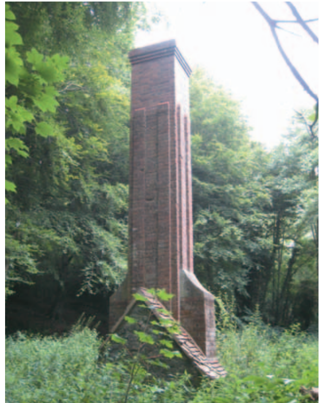
The ruins of a 19th century water pumping station supplying the Rousdon Estate and now part of East Devon's Jurassic Coast (Historic Environment Service, DCC).

The Draft Heritage Protection Bill 2008, recently published by the Department for Culture, Media and Sport, proposes the replacement of the