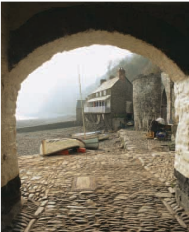
Clovelly Harbour.

Defensive sites: Warfare and defence have left a considerable mark on Devon's landscape. Large hillforts of Iron Age date occupy strategic positions on hills and promontories. Traces of some Roman forts survive, as do parts of the Roman defences at Exeter. Lydford has Saxon defensive banks, and there are many Norman motte and bailey castles, although only a few of these developed into medieval masonry castles as at Okehampton. Coastal artillery fortifications begin in the Tudor period and reached their peak in the 19th century around Plymouth, with chains of forts and batteries, facing both out to sea and inland. Dartmoor contains some of the county's oldest military training areas. The Second World War has left a legacy of anti-invasion defences, such as pill boxes, anti-tank devices, radar stations and anti-aircraft emplacements, alongside evidence of the air and sea counter-offensive, especially airfields and D-Day training and embarkation areas.