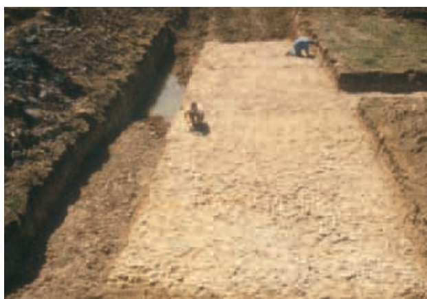
Excavation of the Roman road from Exeter to Dorchester before the construction of the A35 Axminster bypass.