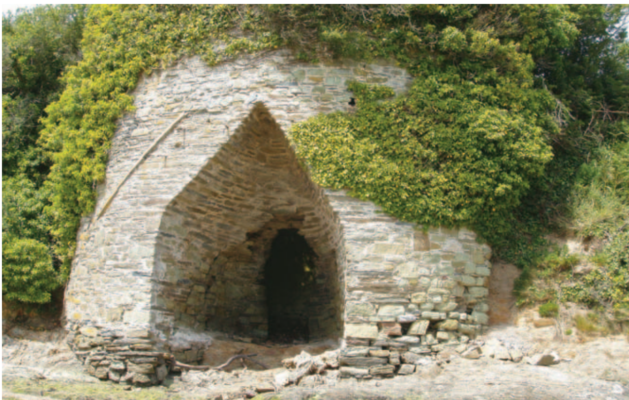
Limekiln on the shore of the Kingsbridge estuary (Historic Environment Service, DCC).