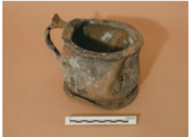
A 17th century pewter chamber pot found during flood alleviation works in the centre of Ottery St. Mary.

Devon's local planning authorities, including the County Council as Mineral and waste Planning Authority, are currently preparing Local Development Documents to replace their Local Plans. These will be of great importance for the protection and management of the historic environment. They should include both core and