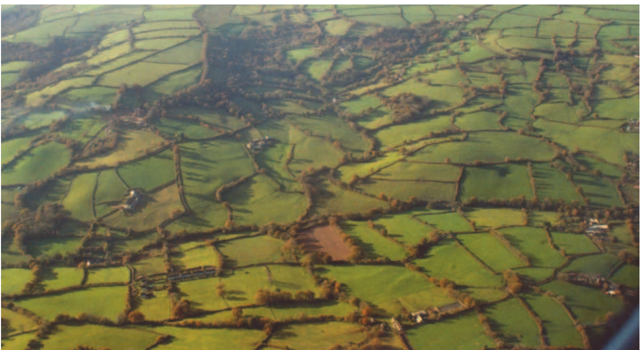
The landscape of the Blackdown Hills, looking west across Luppitt Common.

Greater houses and their settings: Devon has relatively few great houses. The most notable in the county are perhaps the medieval Dartington Hall and from the 18th century Castle Hill, Filleigh. In the 19th century Powderham and Killerton and in the 20th century Castle Drogo are perhaps Devon's greatest houses, but more characteristic of the county at all periods are more modest medium sized houses. The parks and gardens that surround these houses are similarly relatively modest, although the park at Castle Hill and the gardens at Bicton House are notable exceptions to this.