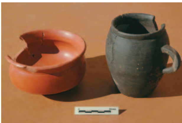
Pottery from Roman Exeter.

Archaeological Sites and Field Monuments: Archaeology is the study of the past through the