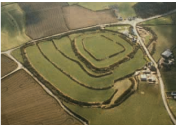
Clovelly Dykes hillfort. The most impressive set of prehistoric earthworks in Devon

These have been present for many centuries, if not millennia. However, since the mid 20th century the rate of change and loss has increased significantly, particularly due to the intensification of agriculture and development.