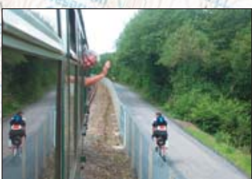
Near Meldon Quarry

Short gated section. Please ensure both gates are closed behind you.