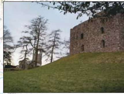
Lydford Castle and Church

These signs indicate that this route, the Granite Way, is part of the 6,000 mile National Cycle Network (NCN). The Granite Way, between Okehampton and Lydford, forms part of NCN route 27, which is also known as the 'Devon Coast to Coast'. The 'Devon Coast to Coast' is a 102 mile cycle/walkway between Ilfracombe and Plymouth, much of which is traffic free like the Granite Way. The NCN in Devon is being developed by Devon County Council in partnership with Sustrans, the sustainable transport charity.