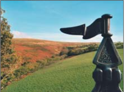
View from Lake Viaduct