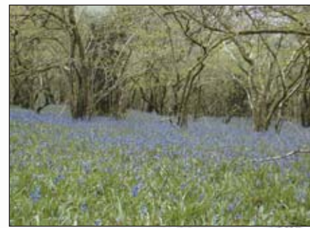
Bluebell Wood, near Meldon

Best Whole Journey Experience Highly Commended 2002