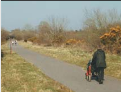
Some sections suitable for wheelchair users