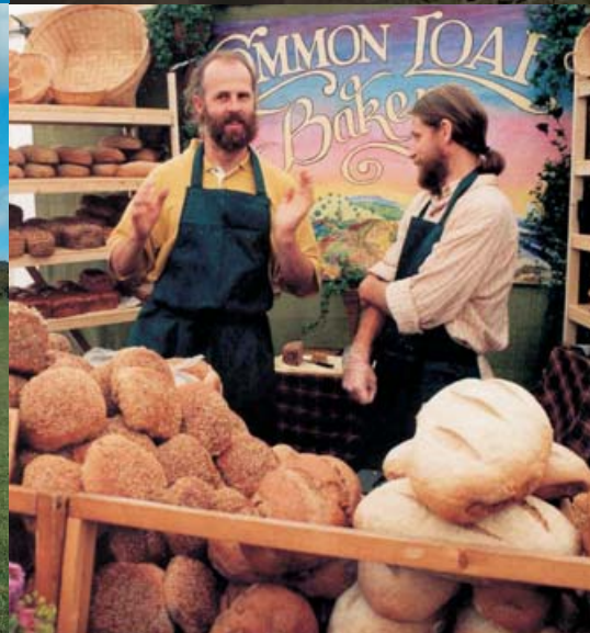
Local Products Strategy – delivering £2m European funding into the Blackdown Hills AONB