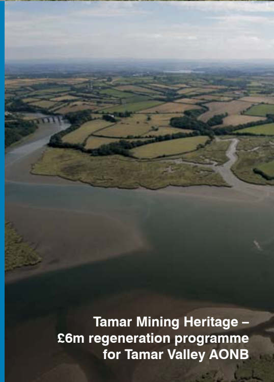
Tamar Mining Heritage – £6m regeneration programme for Tamar Valley AONB