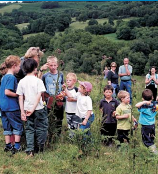
Blackdown Tales – encouraging enjoyment of the area through a programme of guided walks and activities