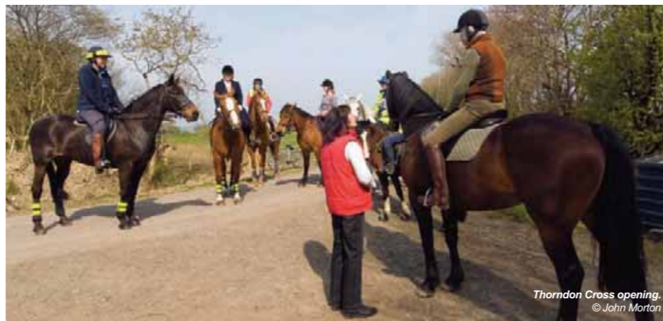
Thorndon Cross opening.