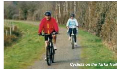
Cyclists on the Tarka Trail