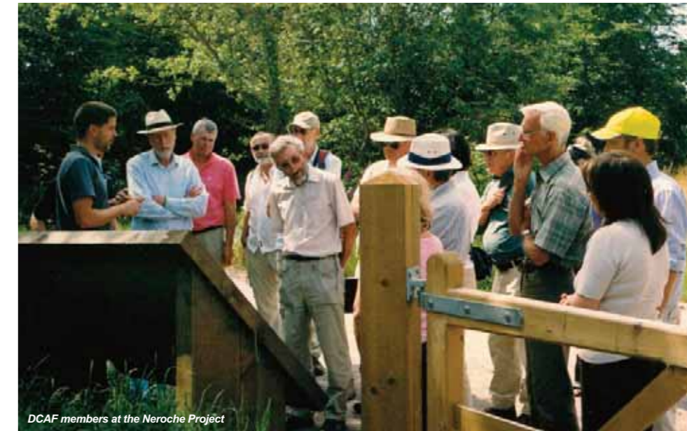
DCAF members at the Neroche Project