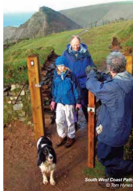
South West Coast Path