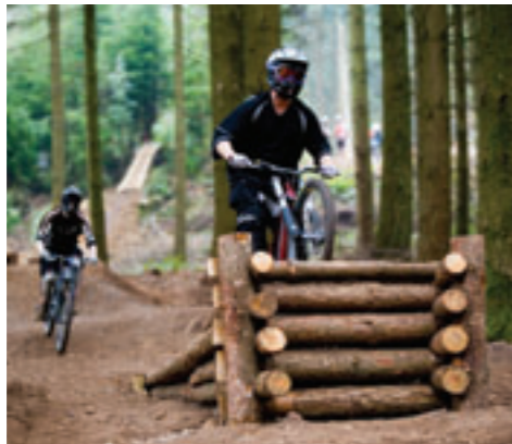
© Forestry Commission Haldon Forest Park

We supported initiatives opening up opportunities for access to groups who do not currently visit the countryside or urban green space. We undertook to ensure diversity objectives were included in relevant policy documents. Proposals to develop the Action Plan are awaited.