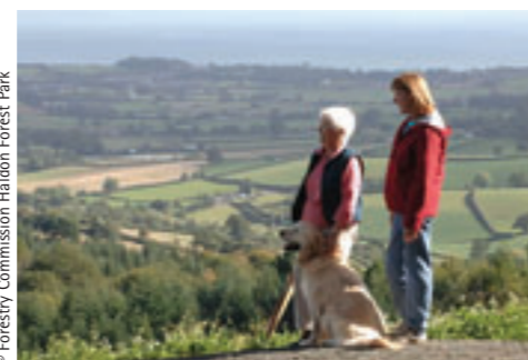
Haldon Forest Park

Now completing its fourth year, the Devon Countryside Access Forum was set up by Devon County Council under sections 94 and 95 of the Countryside and Rights of Way (CROW) Act 2000. The Forum has a statutory role to advise specified bodies on improving access to land for open-air recreation and enjoyment.