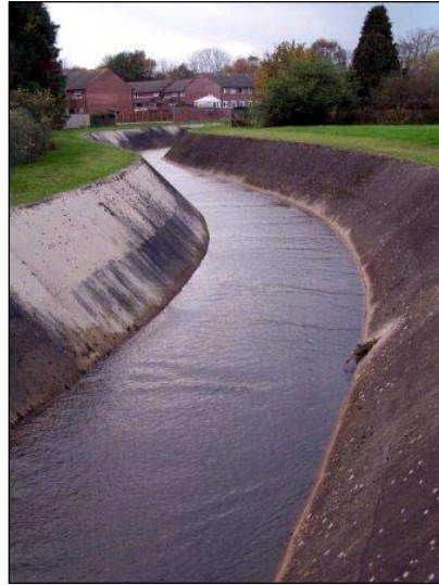
Two faces of the Alphin Brook as it flows through Exeter.