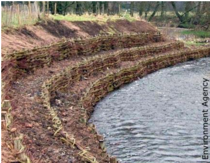
An example of good practice: 'Soft engineering' to stabilise a river bank.