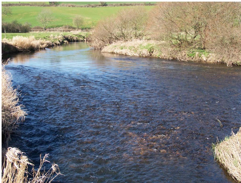
The River Axe

The major floodplain systems in Devon are found on the Axe, Exe (and its tributaries such as the Clyst and Culm), Teign, Tamar, Torridge and Taw. The total area of seasonally inundated grassland (also known as grazing marsh) in Devon is about 6000 ha. Floodplain is found in all catchments, so it is likely that there are further areas of small floodplain strips which are not accounted for in this figure.