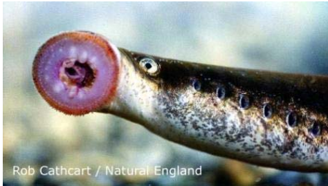
Rob Cathcart / Natural England

The Abbey River and Hartland Coastal Streams are short, tumbling into the sea through deeply-cut and wooded valleys, and often pouring over a waterfall to reach the sea. These streams are relatively undisturbed and support brown trout, bullheads and otters, and provide the moisture for mosses and liverworts in the oak woodlands of the valleys.