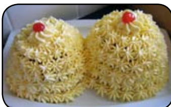
Celebrating in style with novelty cakes