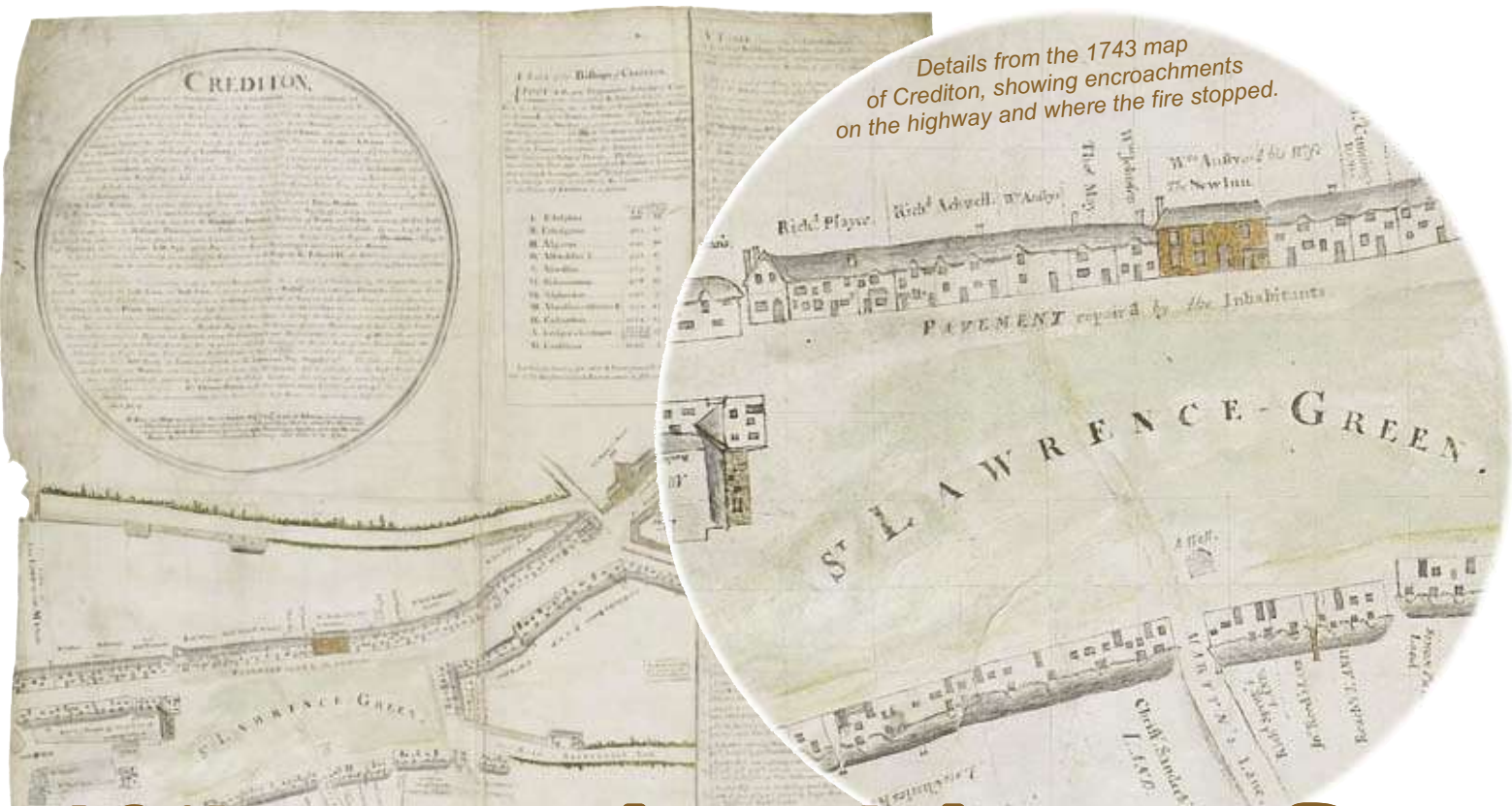
Details from the 1743 map of Crediton, showing encroachments on the highway and where the fire stopped.