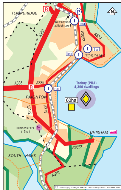
Devon Structure Plan 2001 to 2016 : (Adopted October 2004) Inset C - Policies and Proposals at the Torbay Principal Urban Area (PUA)